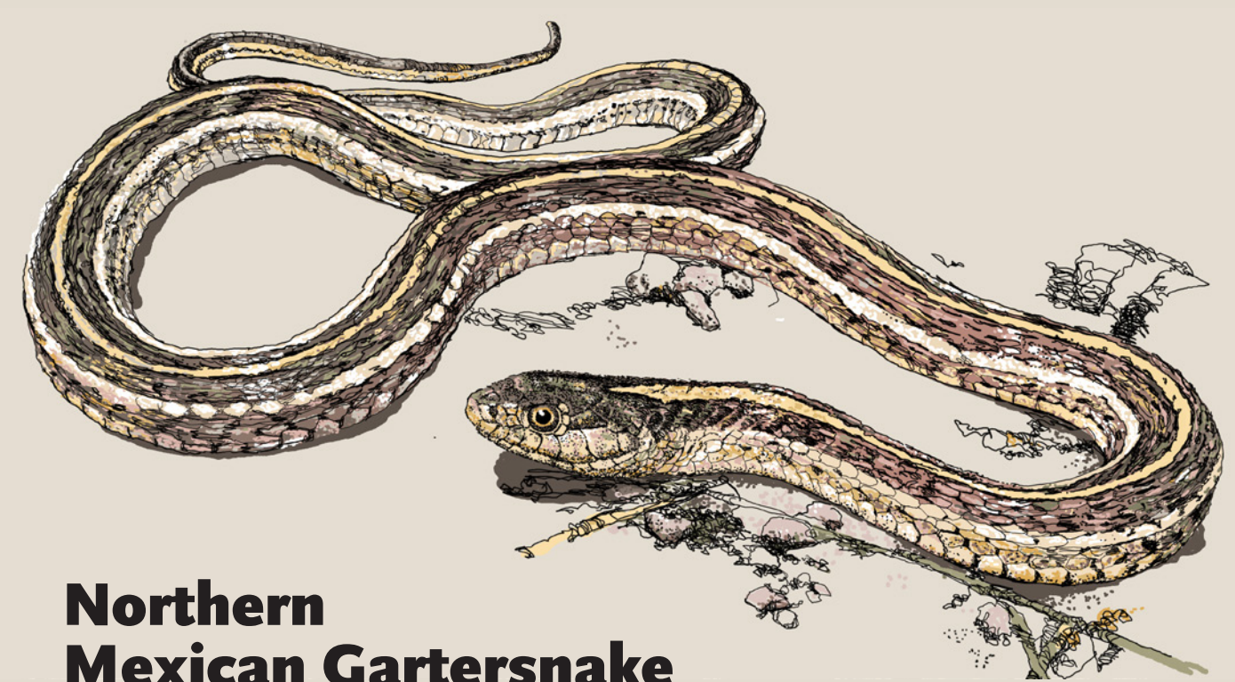
Northern Mexican Gartersnake

Dos especies de culebras garter no venenosas viven cerca de Oak Creek, donde ellas cazan peces pequeños. La culebra garter mexicana nortea (“northern Mexican gartersnake” en inglés) se encuentra en la parte baja de Oak Creek. La culebra garter de cabeza angosta (“narrow-headed gartersnake” en inglés) vive río arriba en el Cañón Oak Creek como una de las últimas poblaciones de su especie en Arizona. Es contra la ley molestar, recoger, herir o matar estos réptiles poco comunes. Manténgase en los senderos señalados para no dañar su hábitat ribereño.